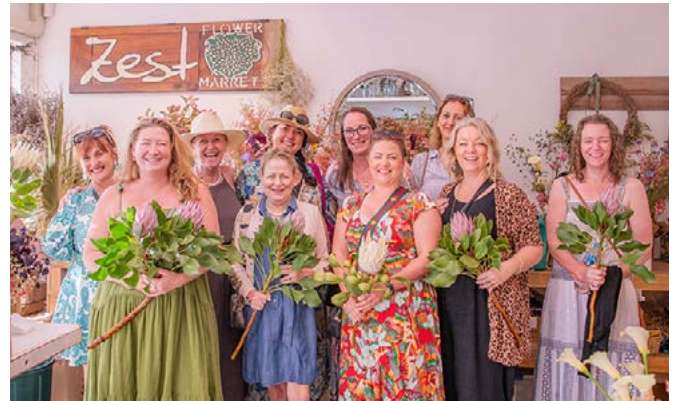
Visiting Zest Flowers, Dunsborough, WA