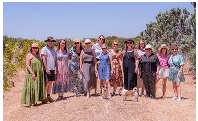
Nubloom Flower farm tour