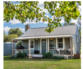
Odd Frog Lodges, NSW