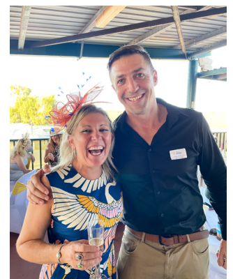
Taryn (Taryn Yeates Photography), Giles (Giles Tipping - Ray White Broome)